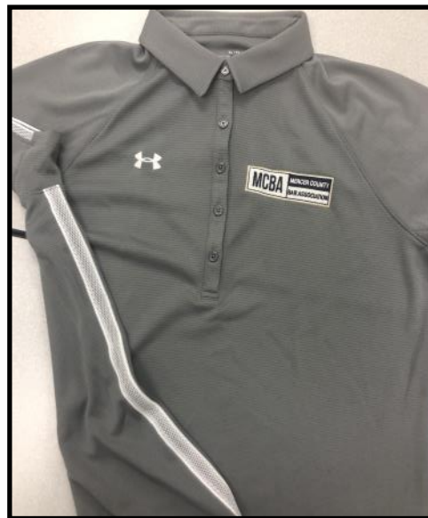
Women's shirt $45 SMALL, MEDIUM, LARGE, & X-LARGE