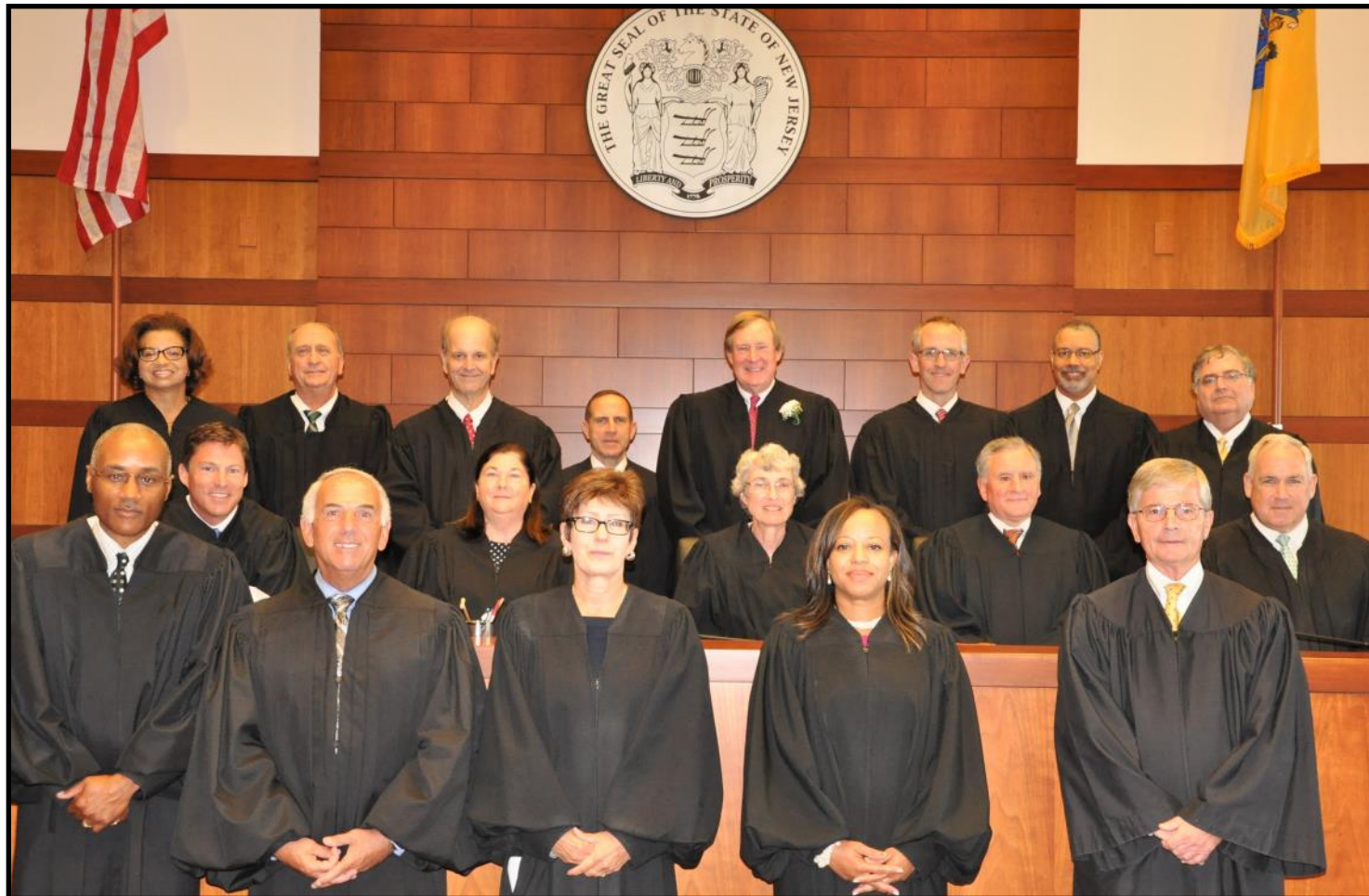
Judges of the New Jersey Superior Court for the Mercer Vicinage.