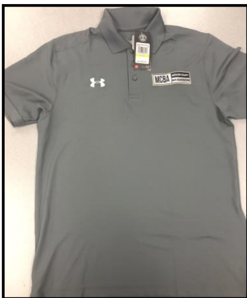
Men's shirt $50 SMALL, MEDIUM, LARGE, X-LARGE AND 2X-LLARGE